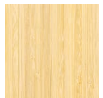
Vertical Grain Natural