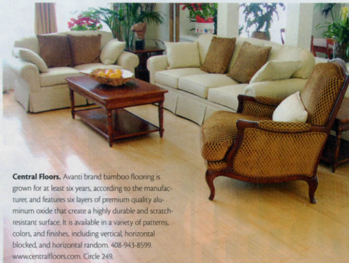
Central Floors. Avanti brand bamboo flooring is grown for at least six years, according to the manufacturer, and features six layers of premium quality aluminum oxide that create a highly durable and scratch-resistant surface. It is available in a variety of patterns, colors, and finishes, including vertical, horizontal blocked, and horizontal random. 408-943-8599. www.centralfloors.com . Circle 249.