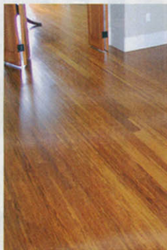
Sustainable Flooring. Strandwoven bamboo flooring is a compressed and densified bamboo composite. The maker says it does not use aluminum oxide in its prefinished coating because it scratches white. Colored Strandwoven has color infused into the wear layer before compression. Traditional bamboo flooring also is available in two shades of carbonized or natural. 303-544-6076. www.sustainableflooring.com . Circle 253.