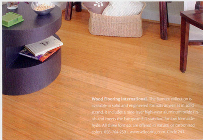
Wood Flooring International. The Bamtex collection is available in solid and engineered formats as well as in solid strand. It includes a nine-layer high-wear aluminum oxide finish and meets the European E-1 standard for low formaldehyde. All three formats are offered in natural or carbonized colors. 856-764-2501. www.wflooring.com . Circle 241.

Bamboo Mountain. The 6-foot Long Strip bamboo flooring is constructed with near-zero VOC content. The 6-foot-by-6-inch Wideplank bamboo flooring is constructed from solid Moso bamboo. Fuse Strand woven bamboo flooring is nearly twice as strong as regular bamboo, the maker says. 877-700-1772. www.bamboo-mountain.com . Circle 242.