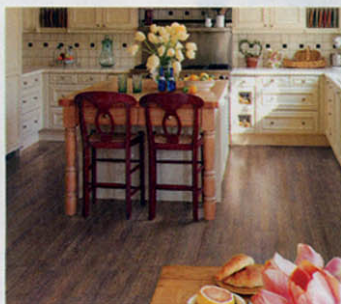
Teragren. The manufacturer offers five types of bamboo flooring: Synergy Strand; Signature Naturals, with a traditional random-length look; Signature Colors, in espresso, cherry, charcoal, and walnut stains; Craftsman, which features a wider, longer plank look; and Studio, which features TeraLoc, a patented self-locking system that requires no adhesive. The maker says it uses only Optimum 5.5 Moso bamboo to produce flooring 25 percent harder than oak. 800-929-6333. www.teragren.com . Circle 250.