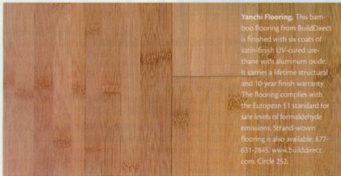
Yanchi Flooring. This bamboo flooring from BuildDirect is finished with six coats of satin-finish UV-cured urethane with aluminum oxide. It carries a lifetime structural and 10-year finish warranty. The flooring complies with the European E1 standard for safe levels of formaldehyde emissions. Strand-woven flooring is also available. 877-631-2845. www.builddirect.com . Circle 252.

woven, or OSB bamboo that compacts small strands of bamboo fiber with resin to create a composite type of floor board that is about twice as hard as standard bamboo flooring.