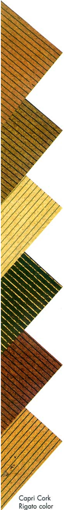
Capri Cork Rigato color selections.

At top: Encapsulate the timeless beauty found in Anderson's Dellamano Collection 6.25" wide Hickory planks in color Biscotti. At bottom: It's Bamboo! Teragren's Signature Colors collection.