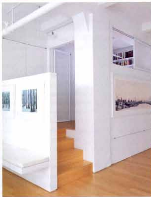
CLOCKWISE FROM TOP: The study's aluminum shelving by Rakks overlooks an Eames-designed swivel chair by Herman Miller. The photographs on either side of the study entry are by Dorte Alstrup (left) and Tetsugo Hyakutake; the doors and sliding window are by PK-30 System. A DeLonghi oven is integrated into the Corian kitchen island; the range is by Viking.