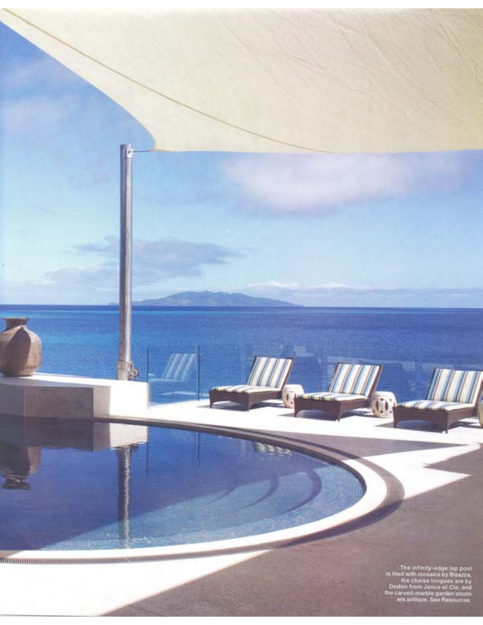
The infinity-edge lap pool is tiled with mosaics by Bisazza, the chaise longues are by Dedon from Janus et Cie, and the carved-marble garden stools are antique. See Resources.